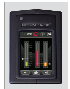
Tx and Rx graph displays power, 2nd and 3rd harmonic levels and touch screen trip and power level adjustments.