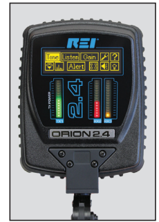
The ORION 2.4 HX has the same line of sight antenna head display as the ORION 2.4.

Product specifications and descriptions subject to change without notice.