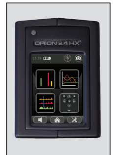
Main Mode selection offers quick, easy mode selection.